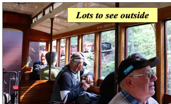
Lots to see outside

We arrived in Gembrook to see this lovely little town, with half visiting 'The Motorist', containing all things memorabilia to do with motoring and