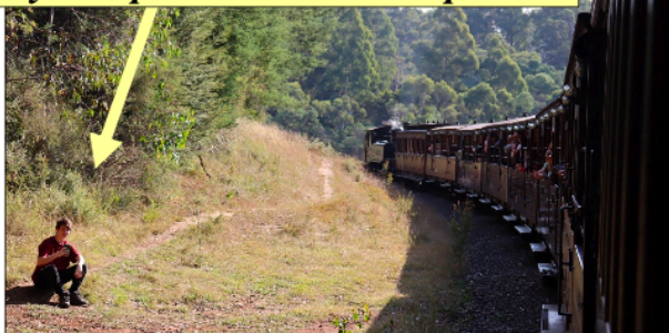
A lonely little petunia in the onion patch ?